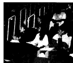
Students at Workshop