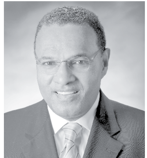
FREEMAN HRABOWSKI III, PHD

In 1988, when he was vice provost of UMBC, Hrabowski co-founded the Meyerhoff Scholars Program with philanthropist Robert Meyerhoff. The program is open to all high-achieving students who want to pursue advanced degrees and research careers in science and engineering, and to advancing underrepresented