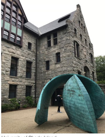
University of Rhode Island

To apply, students complete the admissions application for the college that offers a program through Tuition Break, and declare that program as their intended major. Eligibility is confirmed by the college following acceptance for admission.