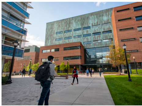
The six-year PharmD is offered through Tuition Break.

Note: State colleges and universities flagged [G] also offer graduate programs.