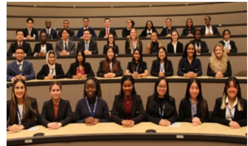
2022 SEP/BaccMD I Participants